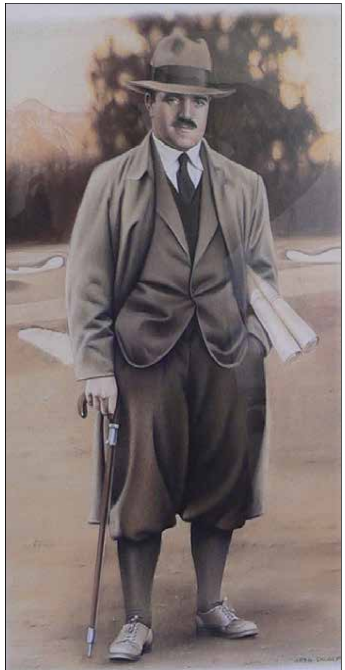
World-famous golf course architect Stanley Thompson designed the original 9 holes at Owen Sound Golf and Country Club, which is now known as Legacy Ridge Golf Club.