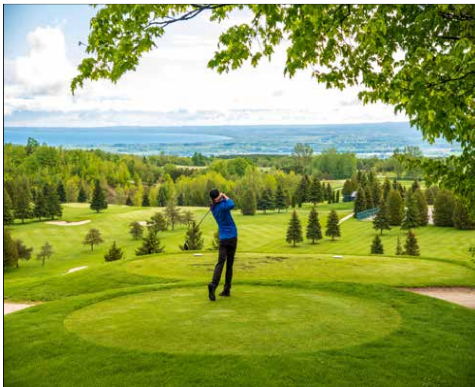
Duntroon Highlands Golf Club near Collingwood offers up spectacular views.