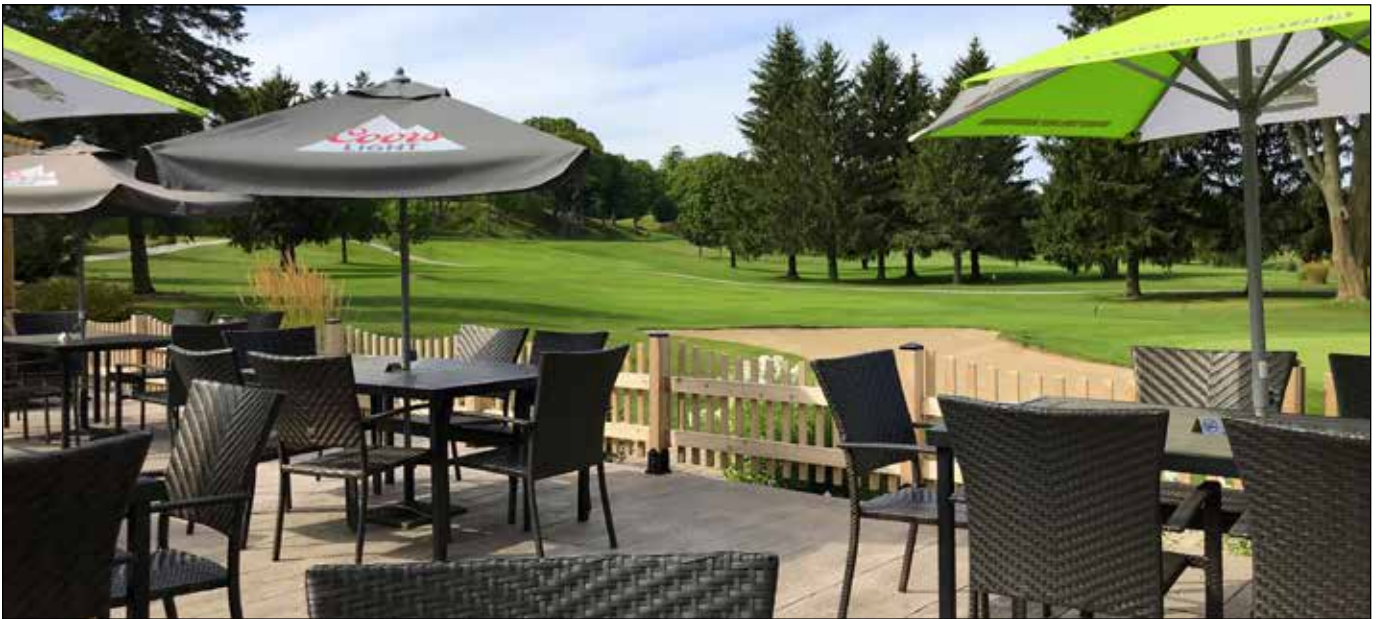
The patio, which provides views of the 18th hole and Owen Sound Bay, was expanded and upgraded in 2019. It was shut down for the first month of the season as part of the COVID-19 restrictions but will re-open for business this Friday (June 12).