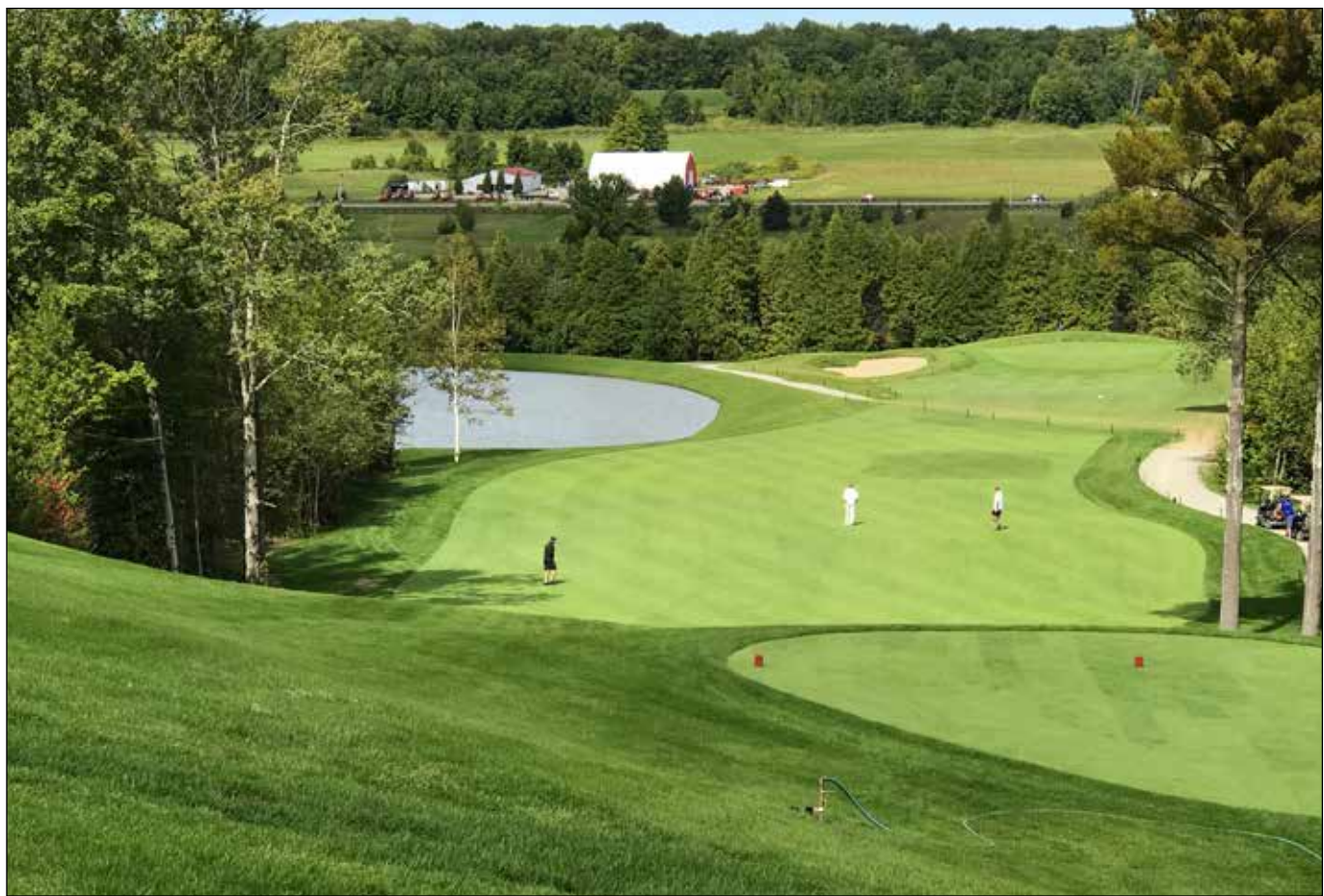
The revamped 10th hole, which now includes a pond, is one of signature holes at the Braestone Club.