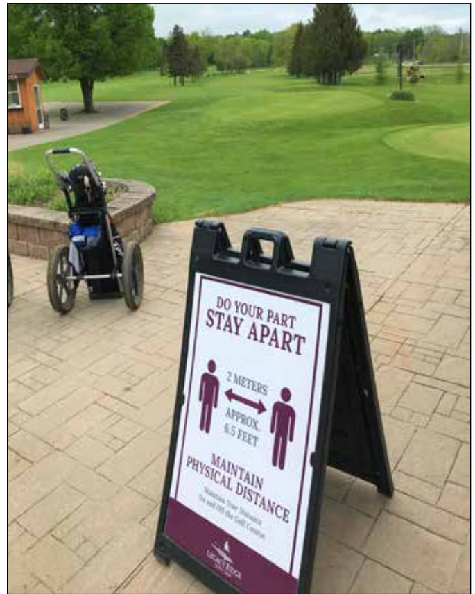
Signs making golfers aware of the COVID-19 rules can be found at clubs throughout the region.

At least two local clubs have reported record attendance at men's league events this spring and