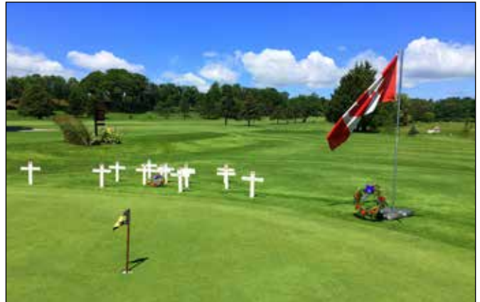
The Wounded Warriors tournament is set for July 23.

The Freedom Riders will be there to conduct the putting contest at the beginning of the round and there will be other surprises throughout the day!