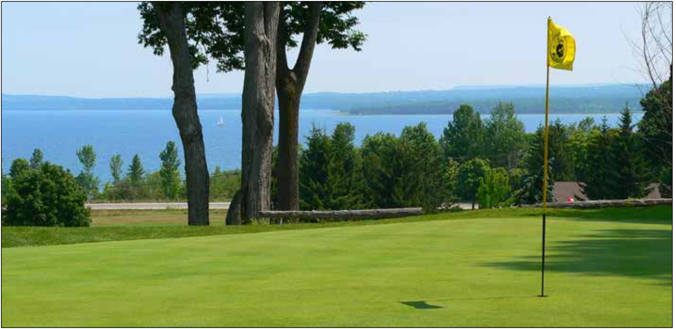
View from the 5th green at Legacy Ridge Golf Club, which is celebrating its 100th anniversary this year.