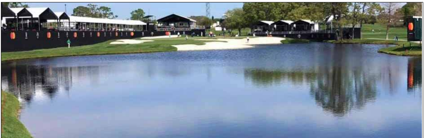
The beautiful par 3 17th hole at the Bay Hill Golf Club near Orlando.